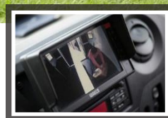
Camera in horse area